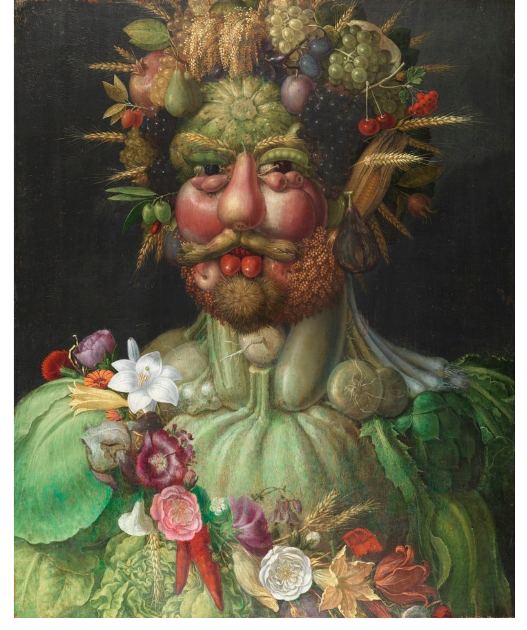
Emperor Rudolf II of Habsburg as Vertumnus